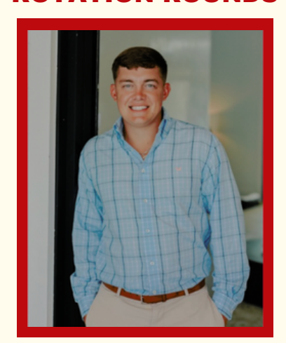
ON ROTATION NIGHTS YOU WILL MEET THE REMAINDER OF THE FRATERNITIES BEFORE THE OPEN HOUSE ROUND IN WHICH YOU CAN CHOOSE WHICH FRATERNITY HOUSE TO VISIT AGAIN,