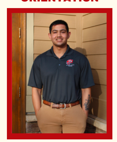
AT FRATERNITY RECRUITMENT ORIENTATION, YOU WILL MEET THE INTERFRATERNITY COUNCIL OFFICERS, RECEIVE INFORMATION ABOUT RECRUITMENT WEEK, AND MEET YOUR RECRUITMENT COUNSELOR ALSO KNOWN AS A RHO ALPHA.