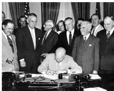
President Eisenhower signing legislation changing Armistice Day to Veterans Day.

In 1954, Congressman Ed Rees of Kansas introduced legislation in the United States House of Representatives to change the name of Armistice Day to Veterans Day. A letter-writing campaign followed to secure the support of all state governors and on June 1, 1954, President Dwight Eisenhower signed legislation changing the name officially to Veterans Day.