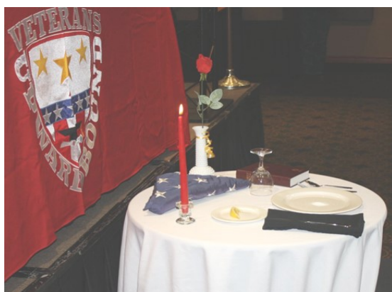
Missing Warrior table