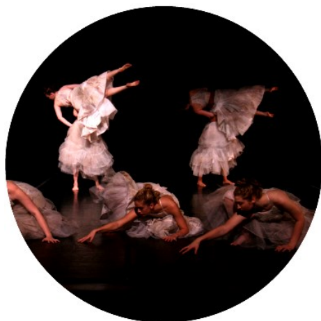
Inside These Walls Evening of Dance 2017