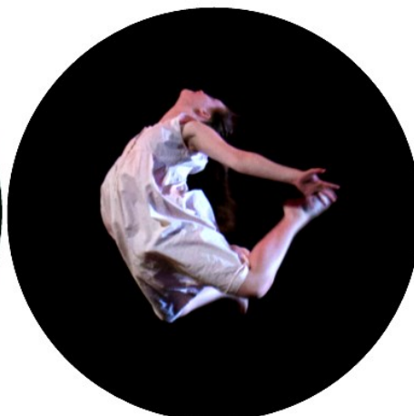
Whispering Insanity Evening of Dance 2017