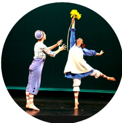
Ride to You WinterDance: Adventures in Toyland