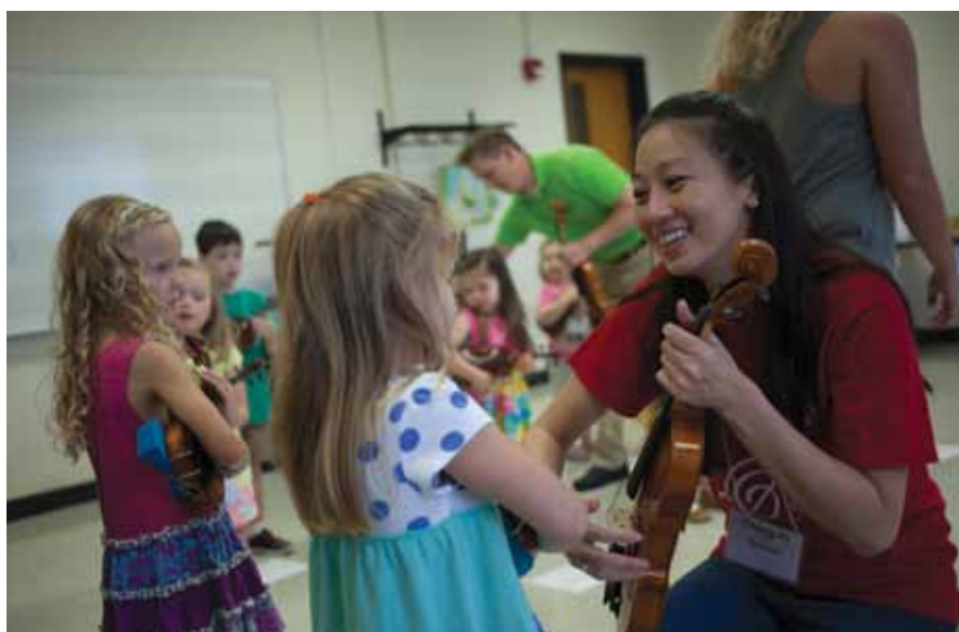
String Explosion Violin Twinklers