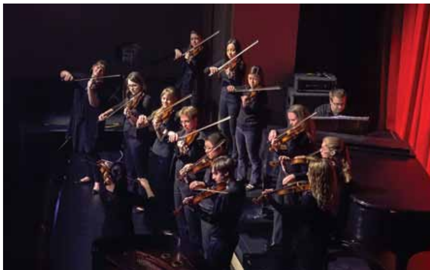
Western Violins at PRISM concert