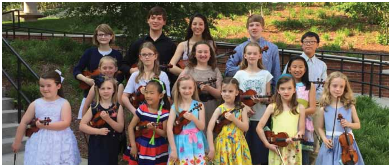
Vivaldi solo recital