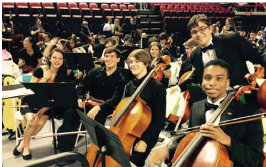
Pre-College students performed at the String Finale Concert