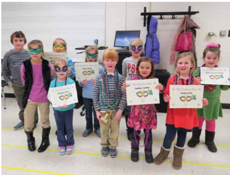
Violin Beginner B Practice-A-Thon Winners