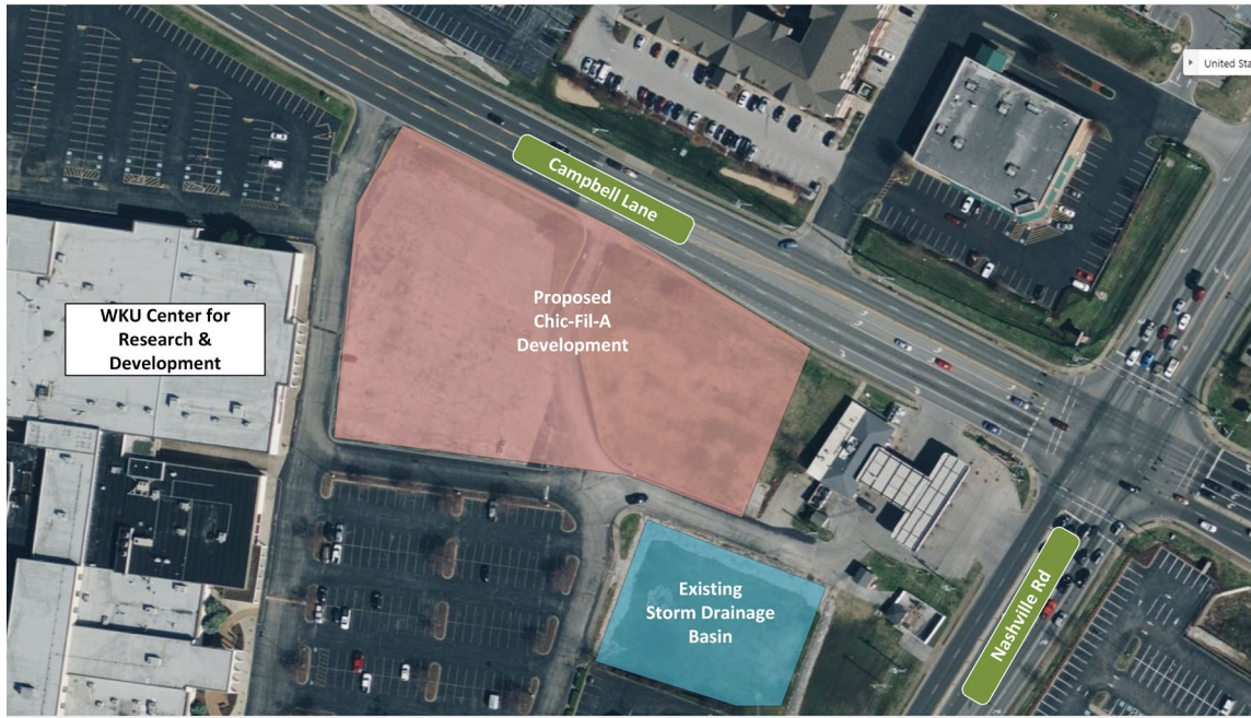
Figure 1. Location of Chic-Fil-A development relative to the existing storm drainage basin on the Center for Research and Development Campus.