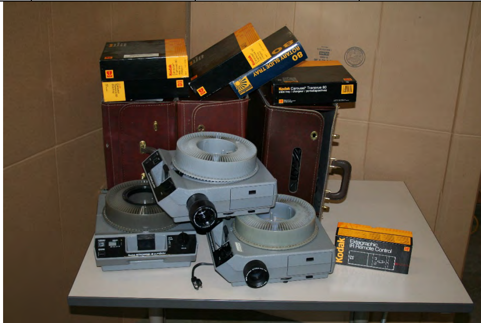
Lots 97 & 98 consolidated