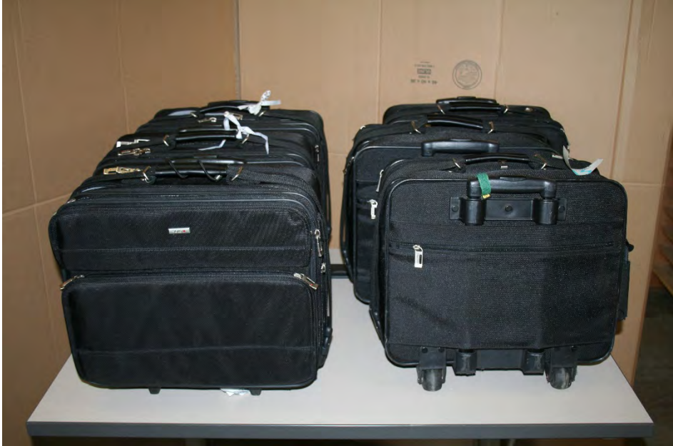
Lots 82 & 83 consolidated