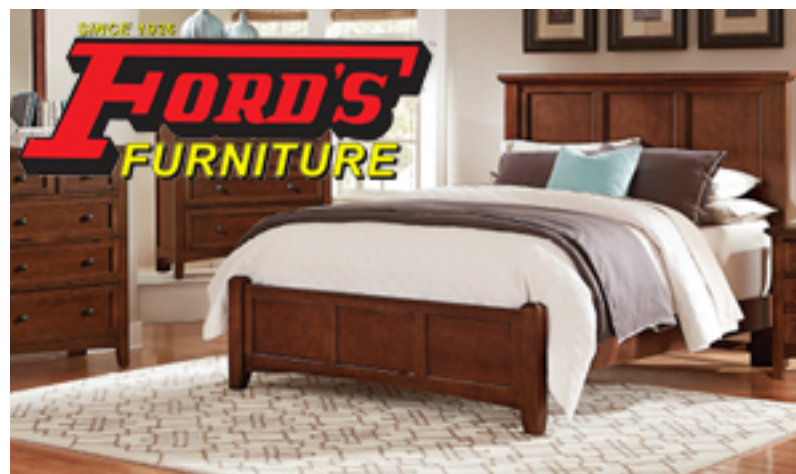
Queen Mansion Bed Hassle Free Price $528 Shown in Cherry (Gray, Merlot, and White Also Available)