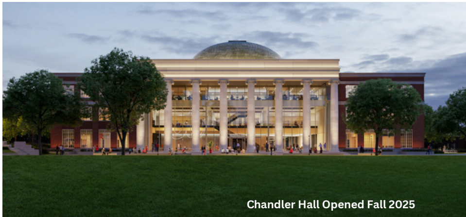
Chandler Hall Opened Fall 2025