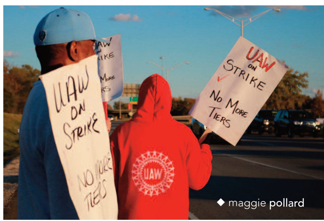
UAW workers lined the corner at Exit 28 for 40 days until an agreement was reached on Oct. 25.

The new changes made in the contract will cost General motors 3 locations. Spande said "GM's goal during the negotiations was to ensure the future of the company is one that works for our employees, dealers, suppliers and the communities where we operate"