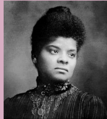
Ida B. Wells: A Passion for Justice

Fiery American suffragette Alice Paul lights a fire under the older women's leaders in Washington DC. President Wilson refuses to give all women the vote, but Paul is prepared to go to prison for her cause.