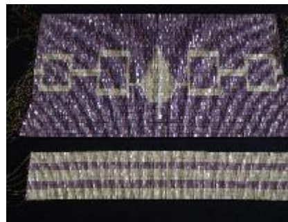
Wampum Iroquois Belts

Chevron and glass wampum style beads were among the most common beads traded to the Native Americans. The Native Americans used them to make necklaces, bracelets, earrings, and to decorate their clothing and gear. The Native Americans sometimes made their own beads out of shell and other natural substances.