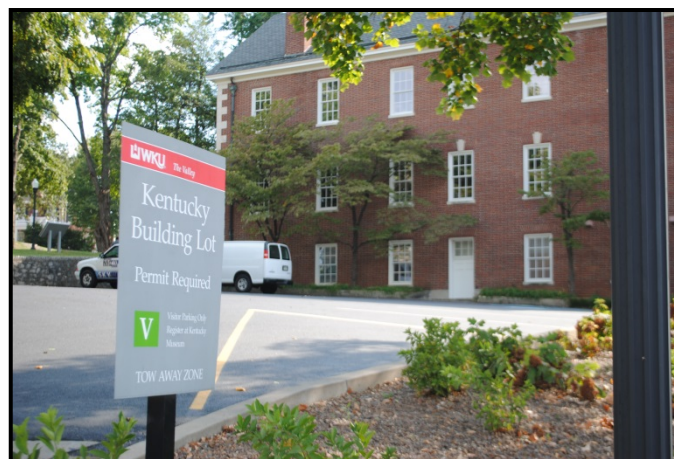
KY Bldg. Lot Visitor Parking