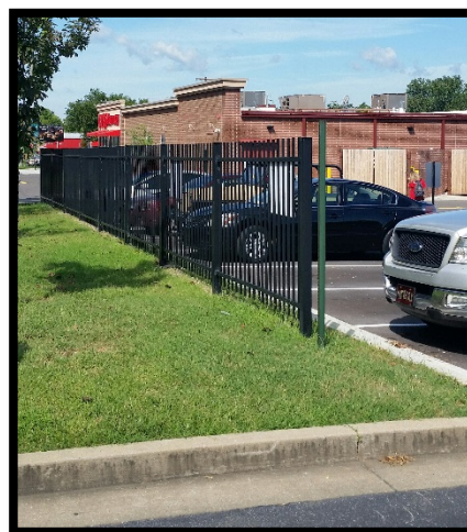
Adams Street Visitor Parking

Each year, we have the most wonderful experiences with our many field trips. The teachers and chaperones are always professional and well organized, and the students are well mannered and inquisitive! We are looking forward to your visit! Thank you again for your volunteer service!