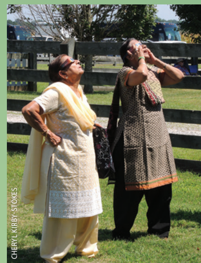
Gatton Academy alumni and current student family members also attended the Solar Eclipse Festival.

Summer daylight quickly evaporated as the moon's shadow passed directly over the festival. The crowd cheered as totality started and ended. The temperature at the local Kentucky Mesonet station nearest the festival fell 13 degrees during the