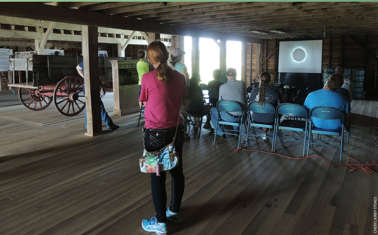
Festival-goers sought shade in the Cinema Barn where short films about total solar eclipses played.