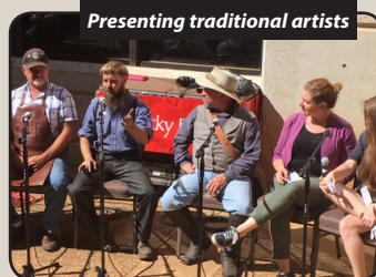
Presenting traditional artists