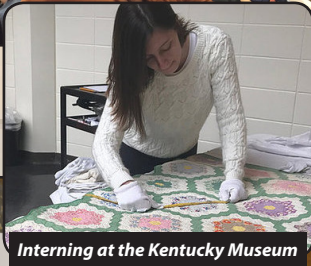
Interning at the Kentucky Museum