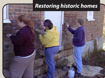
Restoring historic homes

Are you interested in working hands-on with a community to showcase and support local culture? Students in the Public Folklore concentration focus on creating effective public folklore products—festivals, school curricula, and other forms of public programming—in collaboration with communities.