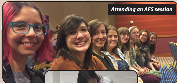
Attending an AFS session

Graduate Assistantships are available to qualified students and are awarded on a competitive basis. Graduate Assistants are paid a stipend and may receive a partial or full tuition waiver. Positions range from assisting faculty members with research and teaching, to working with the Kentucky Folklife Program.