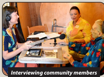
Interviewing community members

Can you picture yourself working in a museum? Students in the Museum Studies concentration receive hands-on training—from exhibit development to education and outreach—to prepare them for a variety of museum careers.