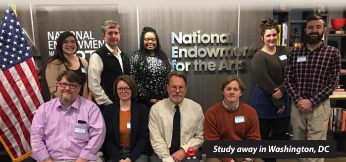
Study away in Washington, DC