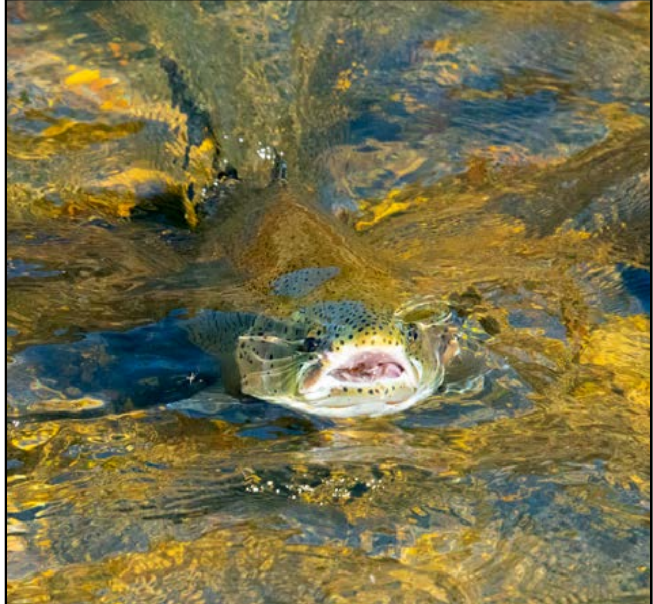
$7.99 US/CAN • www.americanflyfishing.com