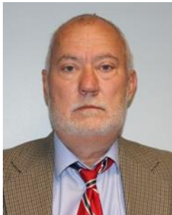
Dan Uhls Maintenance Services