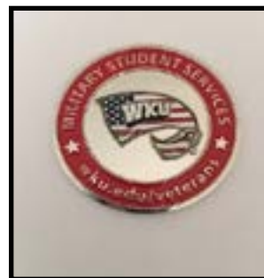
Challenge coin the participants received.