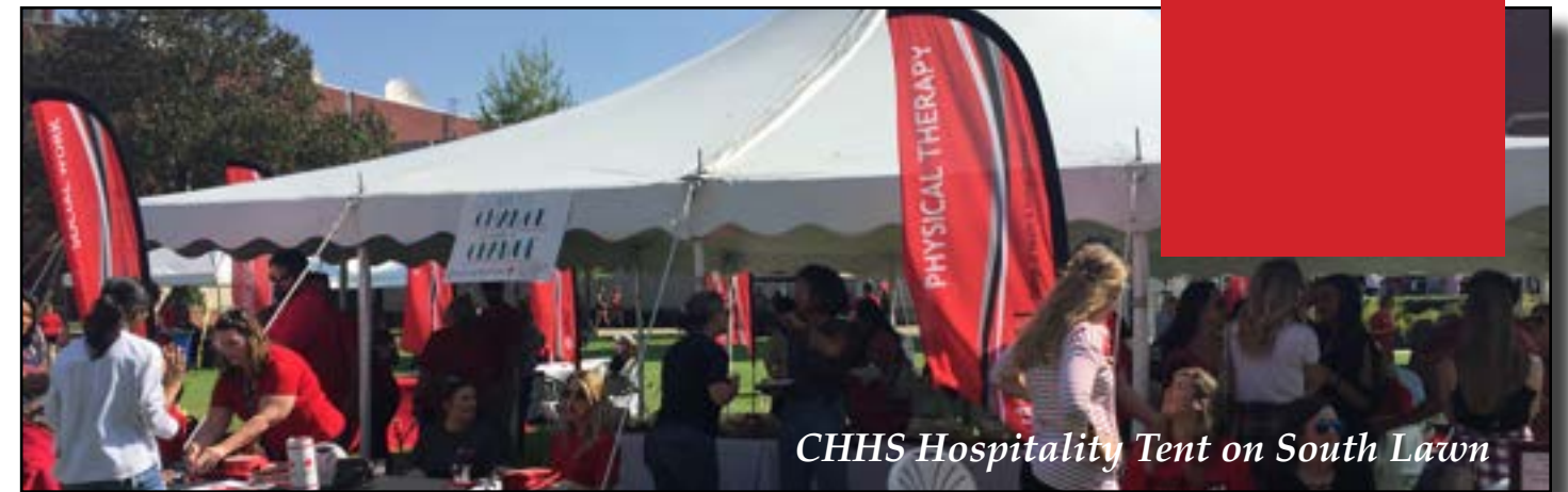
CHHS Hospitality Tent on South Lawn