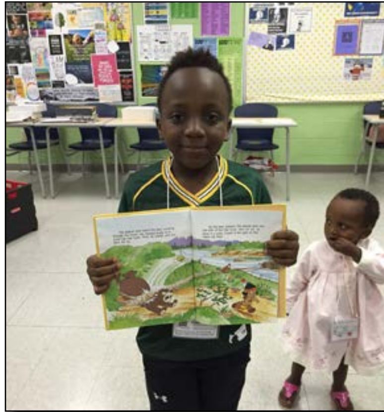
Participant that received a free book after receiving his flu shot!