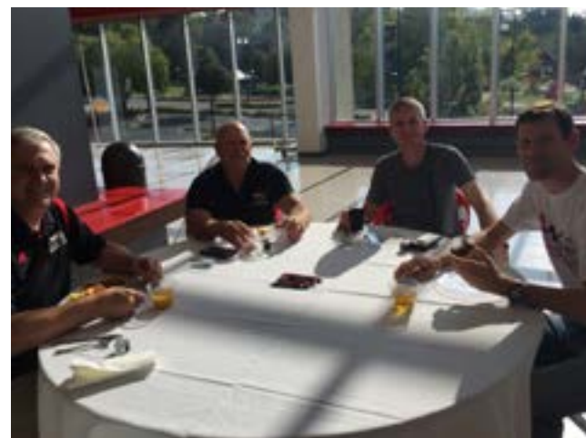
WKU Recreation Administration faculty, staff and alum enjoying a 50th Anniversary Golden Celebration Breakfast