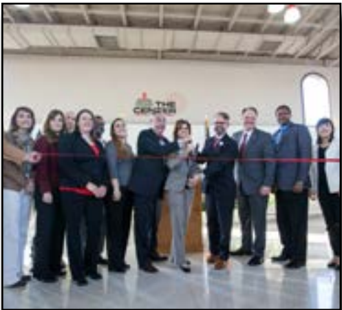
WKU officials and Bowling Green Chamber of Commerce