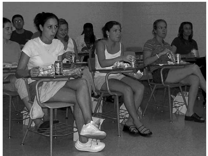
REU interns enjoy their lunch while attending a Brown Bag Seminar