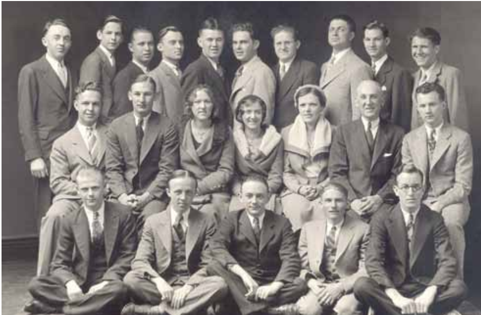
Business University accounting students in 1931.

The Gordon Ford College of Business has established deep roots that have allowed it to grow and thrive throughout its 128-year history. The accomplishments it enjoys today result from the dedication and hard work of many faculty, staff, students, and alumni who believe in its mission: to be a leader in providing high quality, applied undergraduate business education and select graduate programs that meet the needs of the business community.