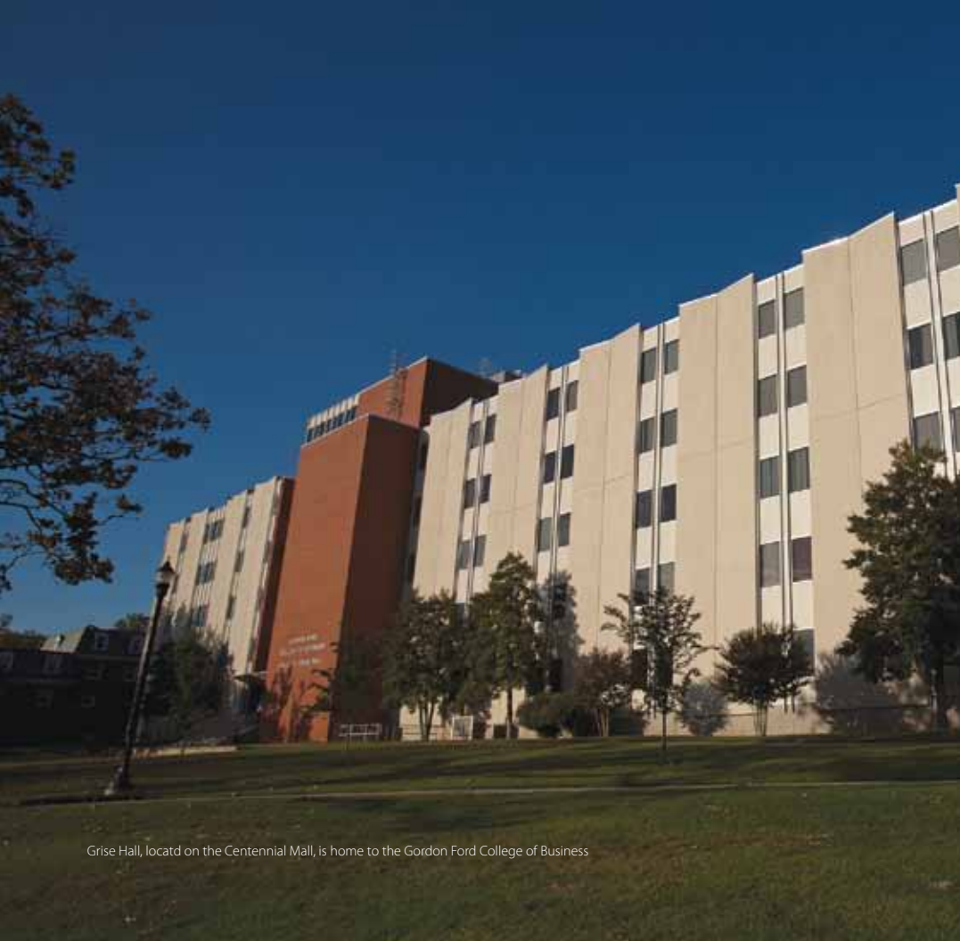
Grise Hall, located on the Centennial Mall, is home to the Gordon Ford College of Business