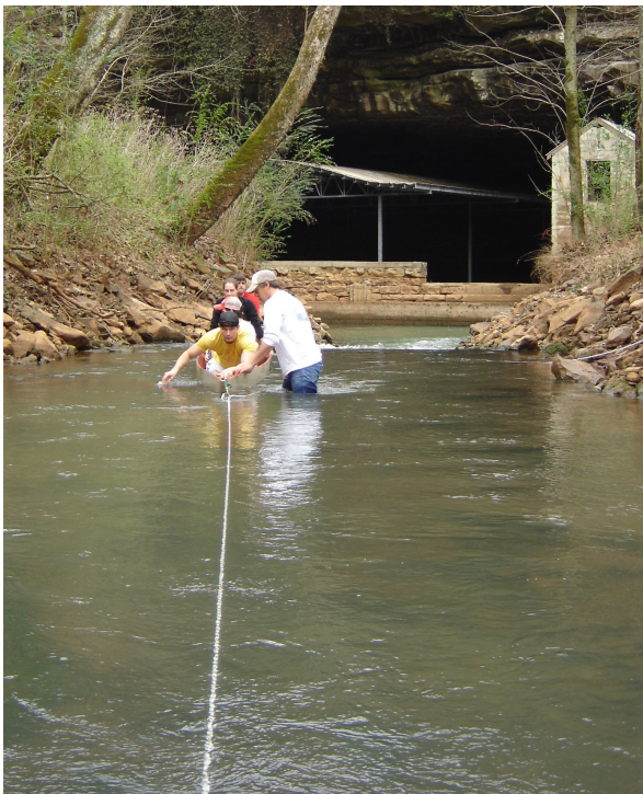
Figure 1. The WKU Concrete Canoe Team measuring drag on the canoe at Lost River.

Construction of concrete canoes and automatic fishing systems may seem like strange activities for future engineers; however, these time-consuming competitions provide many valuable experiences for the teams. The competitions are governed by rigorous specifications provided by ASCE and ASME. The design process is comparable to