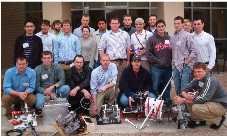
Figure 2. The WKU Junior Design teams and devices at the ASME District Competition in Rolla, MO.

"Each year WKU engineering students work over school breaks and through the night to construct the devices they will use in the competition."