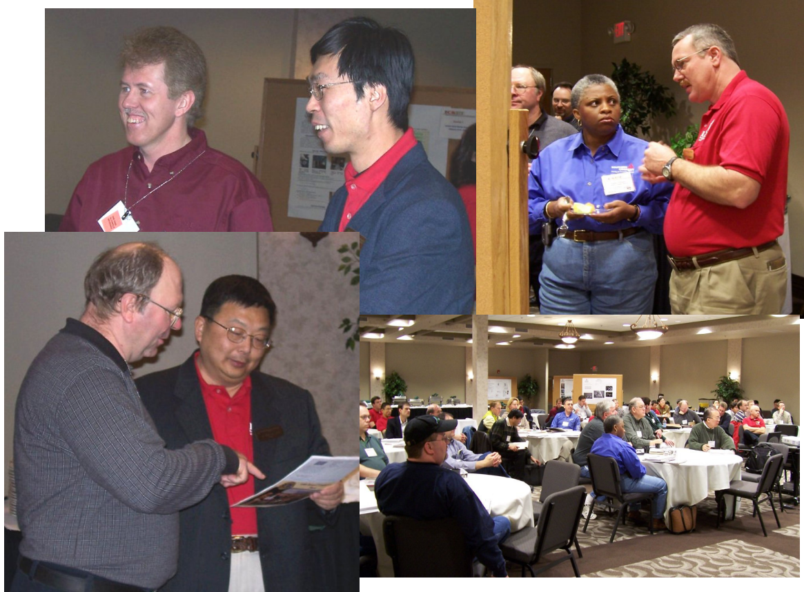
Above Photos: ICSET Mercury Workshop Faculty and Participants

"Was impressed with overall knowledge of each person contacted. People were professional in trying to help"