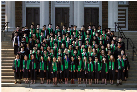
Class of 2018 5 years