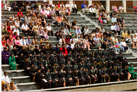
Class of 2008 15 years