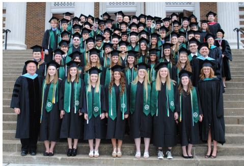
Class of 2013 10 years