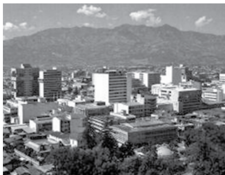
San Jose skyline

This spring, the WKU Wind Ensemble received an invitation from the General Director of Bands under the Ministry of Culture and Youth in Costa Rica to participate in the Fourth Annual Costa Rican Festival of Bands in San Jose on July 4-10, 2011. The Wind Ensemble will present the