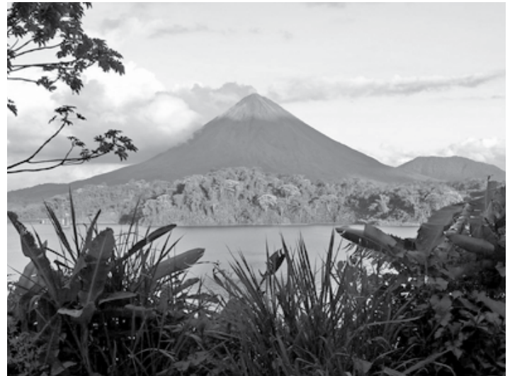
Arenal Volcano in Costa Rica