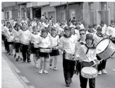
Costa Rican school marching band

Prior to presenting the opening concert for the festival, the WKU Wind Ensemble will present several concerts in San Jose and surrounding communities and will also devote several days to service learning and community outreach projects, including teaching private lessons to school-age Costa Rican children, playing alongside the Costa Rican students in their band rehearsals, coaching sectionals, repairing instruments, etc. Part of this outreach initiative includes WKU students obtaining two gently-used woodwind, brass or percussion instruments each to take with them to donate to the civic and school music programs in Costa Rica. The benefit for this type of service learning