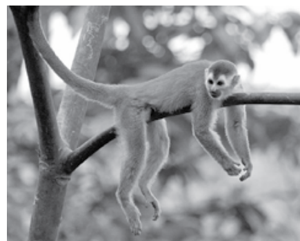
Costa Rican wildlife

engagement for our students is immeasurable.