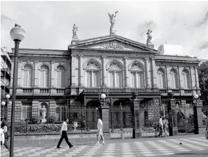
National Theater in San Jose