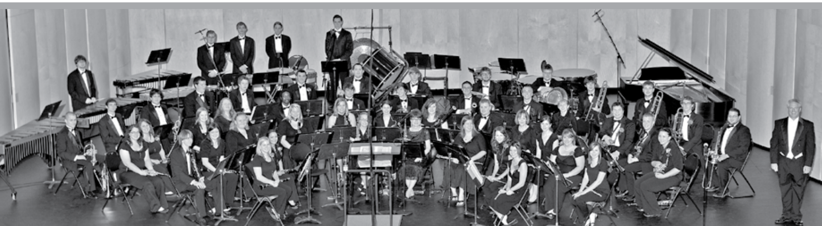
2010 WKU Wind Ensemble in Van Meter Auditorium

This spring, the WKU Wind Ensemble received an invitation from the General Director of Bands under the Ministry of Culture and Youth in Costa Rica to participate in the Fourth Annual Costa Rican Festival of Bands in San Jose on July 4-10, 2011. The Wind Ensemble will present the