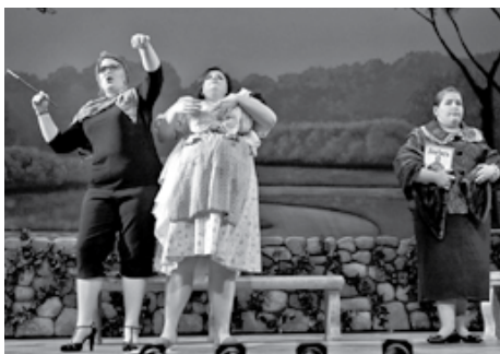
The Devil and Daniel Webster cast

Our annual collaboration this year resulted in two operas and packed houses.