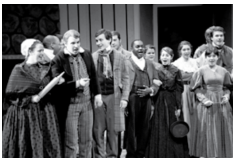
The Game of Chance cast