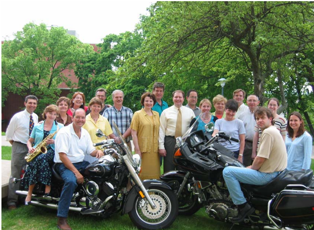
2003-2004 Music Faculty