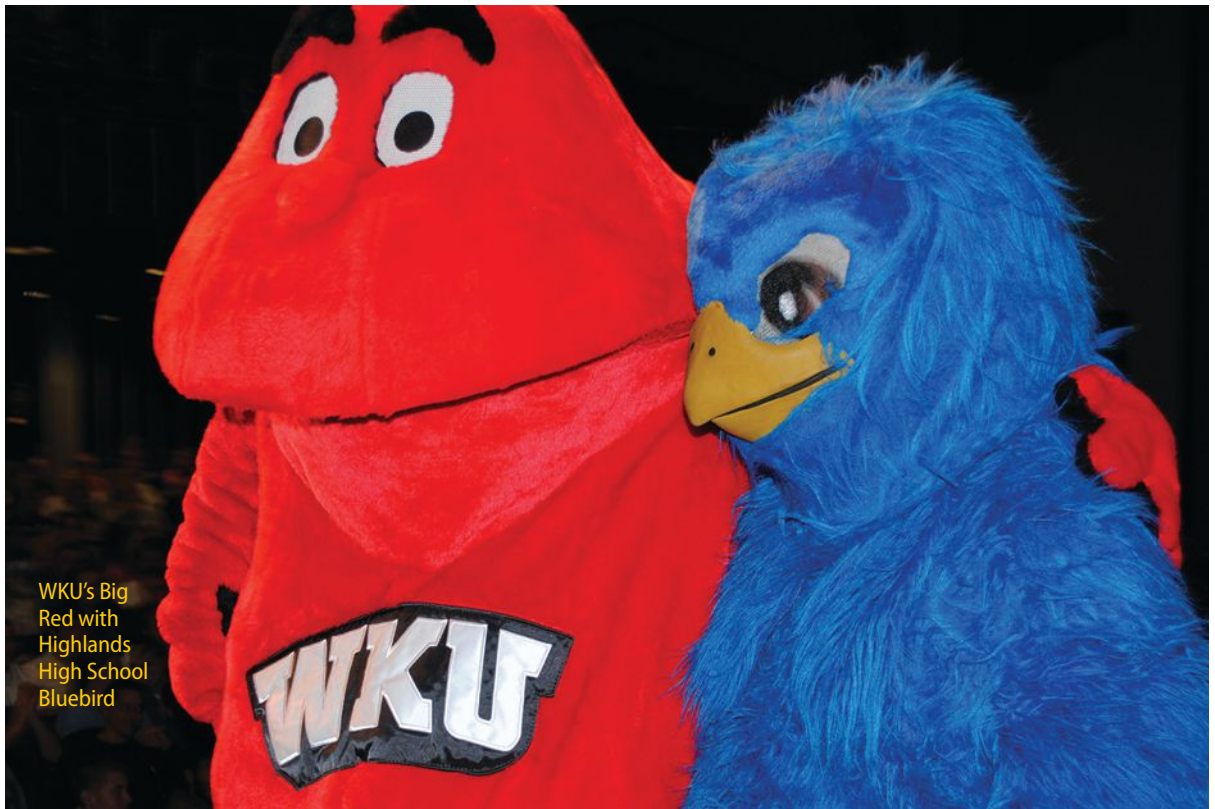
WKU's Big Red with Highlands High School Bluebird