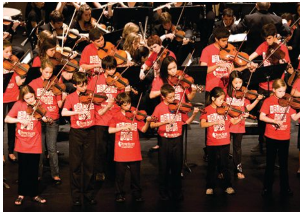
Children from the pre-college string program perform with The Symphony during the "Welcome Home" concert at Van Meter Hall.