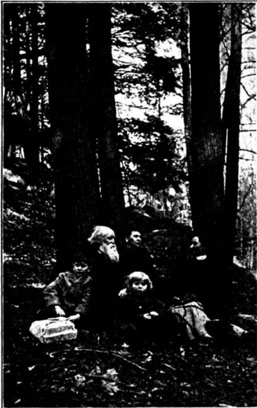
JOHN BURROUGHS AMONG HIS FRIENDS