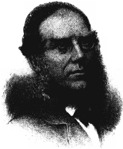
J. D. HOOKER.

respect to a good review, there can be no doubt of its value and utility; nevertheless, if not too late, I hope you will consider deliberately before you decide. Remember what a deal of work you have on your shoulders, and though you can do much, yet there is a limit to even the hardest worker's power of working. I