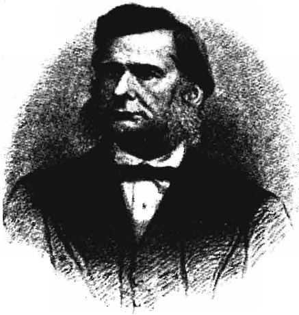
T. H. HUXLEY.

I have been thinking over what you allude to about a natural history review. I suppose you mean really a review and not a journal for original communications in Natural History. Of the latter there is now superabundance. With