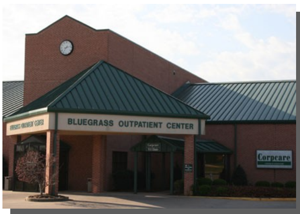
Bowling Green's VA Primary Care facility, Corpcare , 1110 Wilkinson Trace.

The sooner you can become a participant the sooner you can benefit from health care services that you have rightfully earned as a veteran in service to your country.