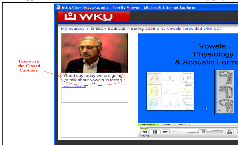
Figure 4: Tegrity Class Recording with Closed Caption 1: The Tegrity Class Editor