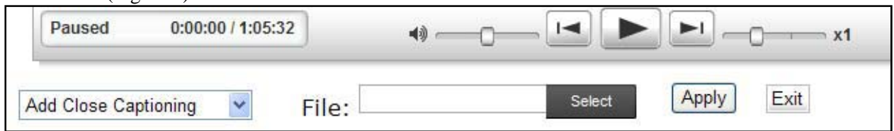
Figure 3: Add Close Captioning Controls