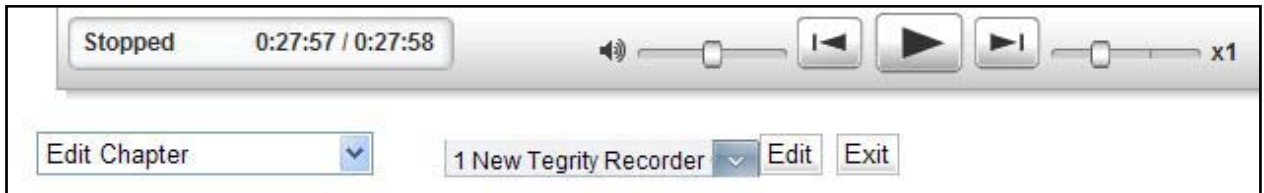
Figure 2: Edit Chapter Controls

2. From the Actions drop-down list (Figure 1), select Edit Chapter . The Edit Chapter controls appear (Figure 2).