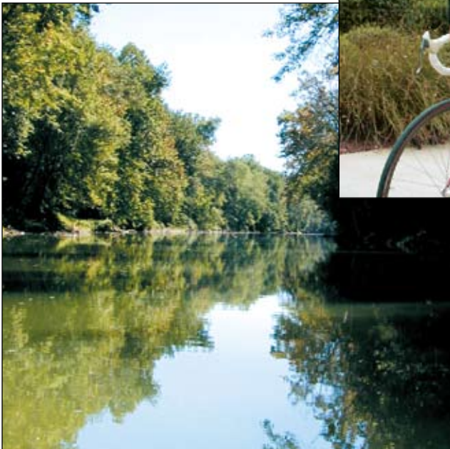
The Upper Green River Biological Preserve offers opportunities for research and regional stewardship projects.