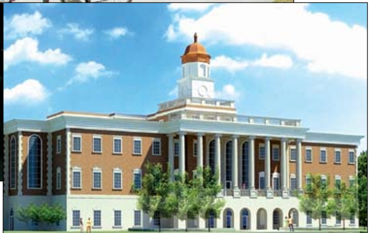
WKU is seeking LEED certification for the new College of Education and Behavioral Sciences building.