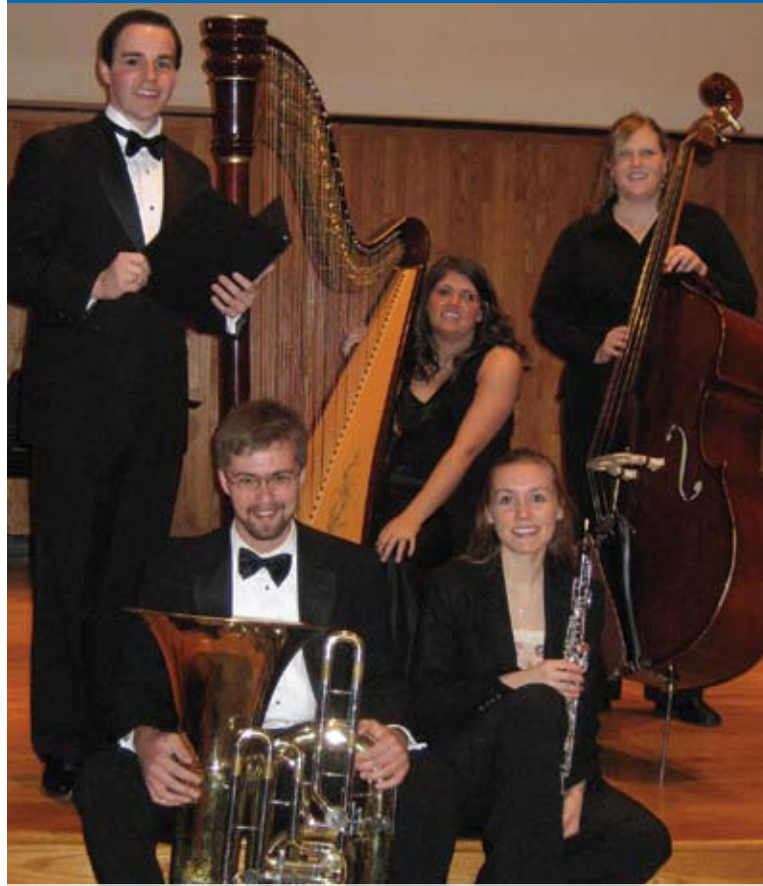
Potter College of Arts & Letters UNDERGRADUATE AND GRADUATE

The Department of Music fosters unforgettable, life-changing music making, welcoming a community of musicians from across all disciplines.