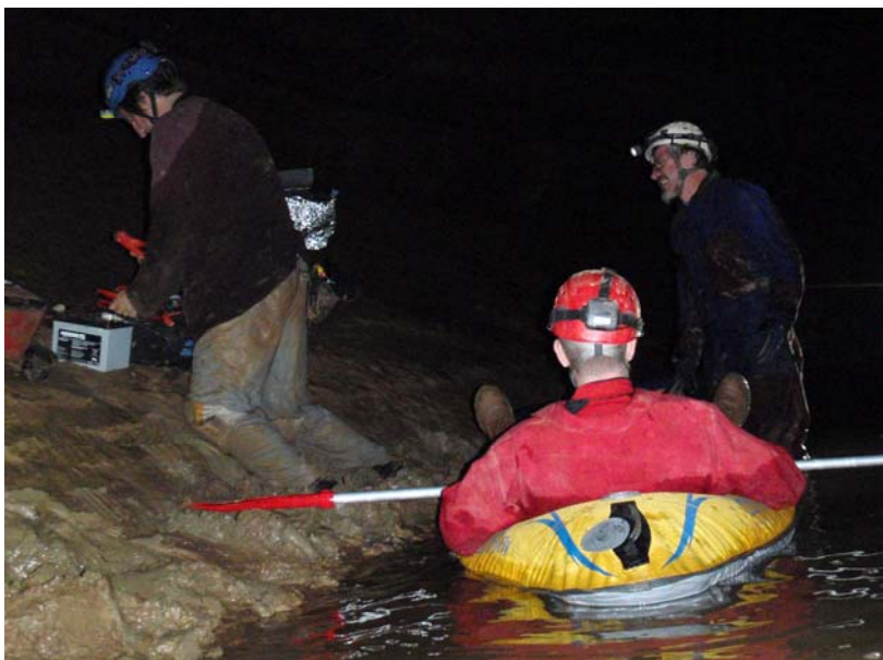
Figure 2: In late FY2010, MCICSL facilitated filming for MACA's new Visitor Center exhibits. MCICSL is a core member of the exhibits development committee and provides technical assistance on scientific topics and information on approaches to convey that science to the public.