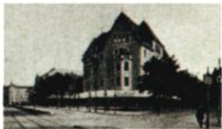
Fig.11 The “Motiv House” in Berlin 1910

In Berlin at the turn of the century, MOTIV festivities were great social events with 1000 guests and more. In 1902 the association moved to an impressive home in Charlottenburg - today the former MOTIV house accommodates the “Renaissance Theatre.”