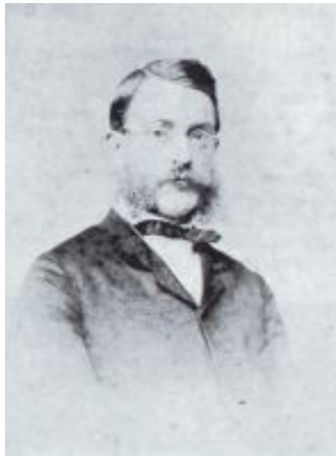
Fig.12 Max Eyth