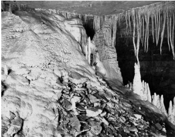
Fig. 5 Violet City, Photograph Max Kämper 1908

We open an envelope and see cave photos. Pictures, taken by Max in 1908 of his discoveries in Mammoth Cave. We recognize the characteristic dripstone cascades of Violet City.