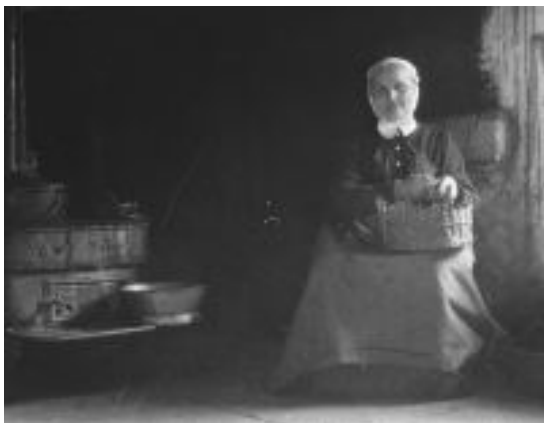
Fig.13 French farmer's wife. Photo Max Kämper 1916

Spring comes and Max goes West. A stately French farm in the Vosges Mountains is chosen for quarters and again there is little evidence that we are in the middle of a world war. Max photographs fields and meadows, calves and pigs. He takes a picture of himself on his horse. We see merry German soldiers cutting asparagus and feeding rabbits, drinking coffee under fruit trees. The first medals are celebrated with champagne: the war - a grand pleasure.