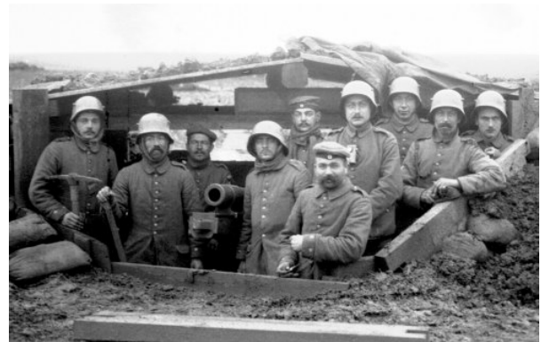
Fig. 14 Shelter during the battle of the Somme 1916