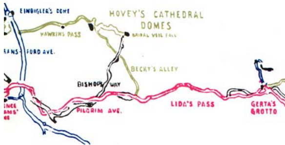
Fig. 8 Detail of the Kämper Map from 1908