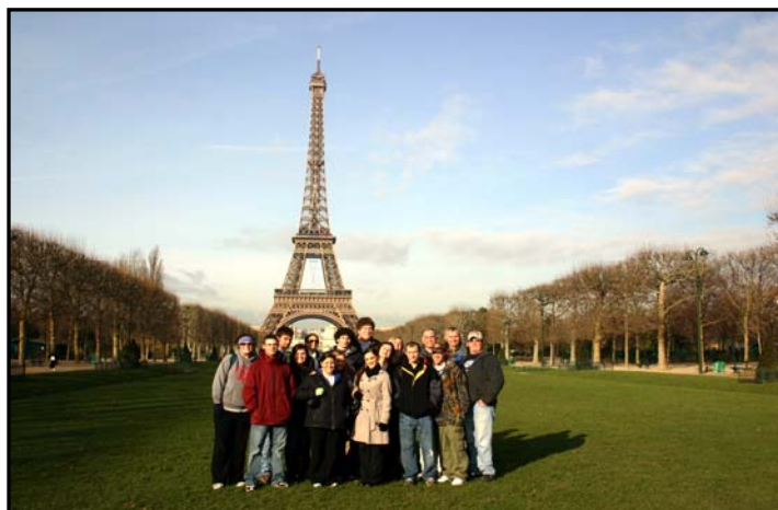
Study Abroad Winter 2007 Leadership in Urban Planning