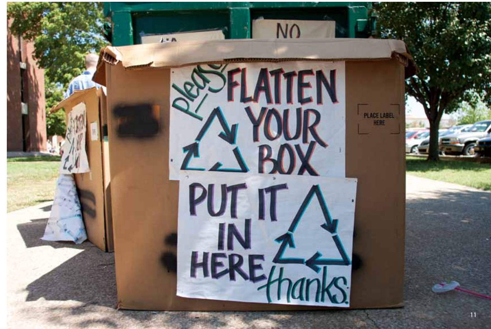
The annual M.A.S.T.E.R. Plan move-in cardboard drive diverts thousands of pounds of cardboard from landfill-bound dumpsters. ►

For more information on the WKU Recycling and Surplus Program, please visit www.wku.edu/recycling