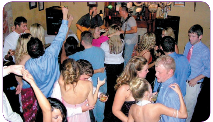
Photos from the 2005 Homecoming Dance