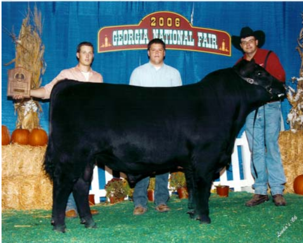
Above: WKU Quest 5422 at the Georgia National Fair where he was Grand Champion Bull