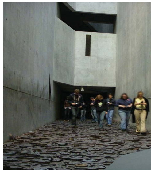
The "Memory Void" at the Jewish Museum in Berlin