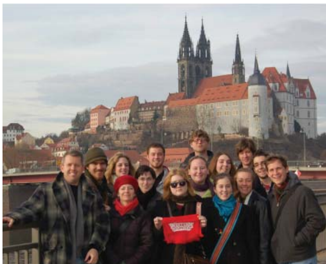
The January 2008 Group on a day trip to Meissen, near Dresden

In addition to class sessions, we will visit the German Parliament, the National Gallery of Art or Museum of Transportation and Technology, Sanssouci – Frederick the Great's Palace in Potsdam, the former concentration camp Sachsenhausen, schools and universities in Berlin, "Autostadt" Wolfsburg (VW), – and science-related destinations.