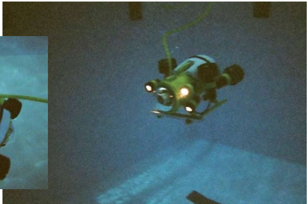
R.O.S., an acronym coined by student engineers that means "remotely operated submersible"