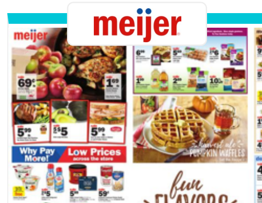
Hover for Circular