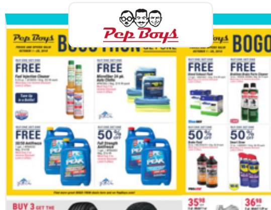
Hover for Circular