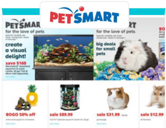
Hover for Circular