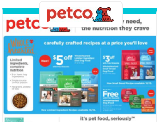
Hover for Circular