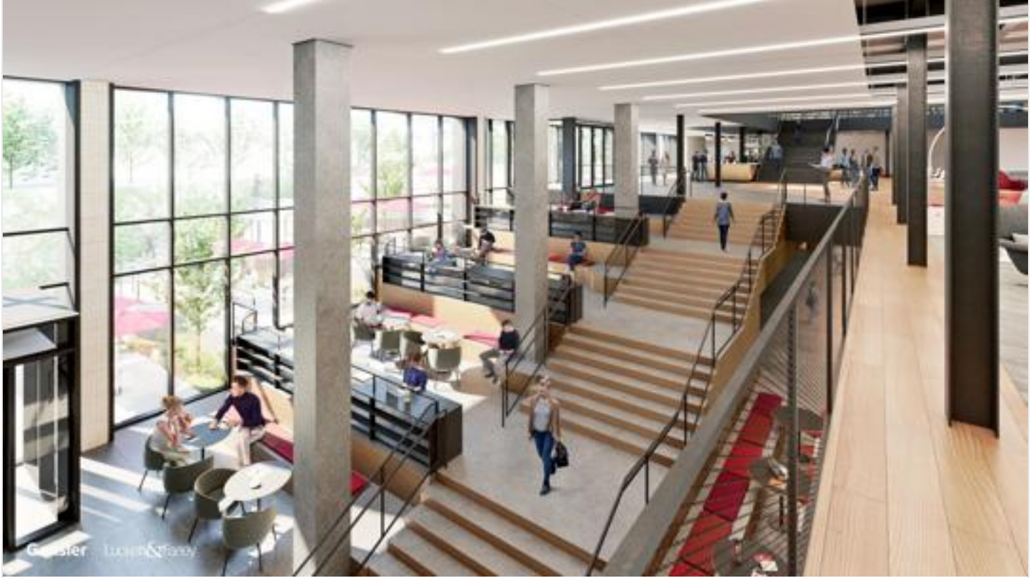
WKU Commons project touted as way to blend social, study spaces